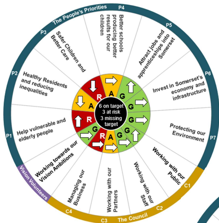
Appendix A – Corporate Performance Report End of September 2017/18